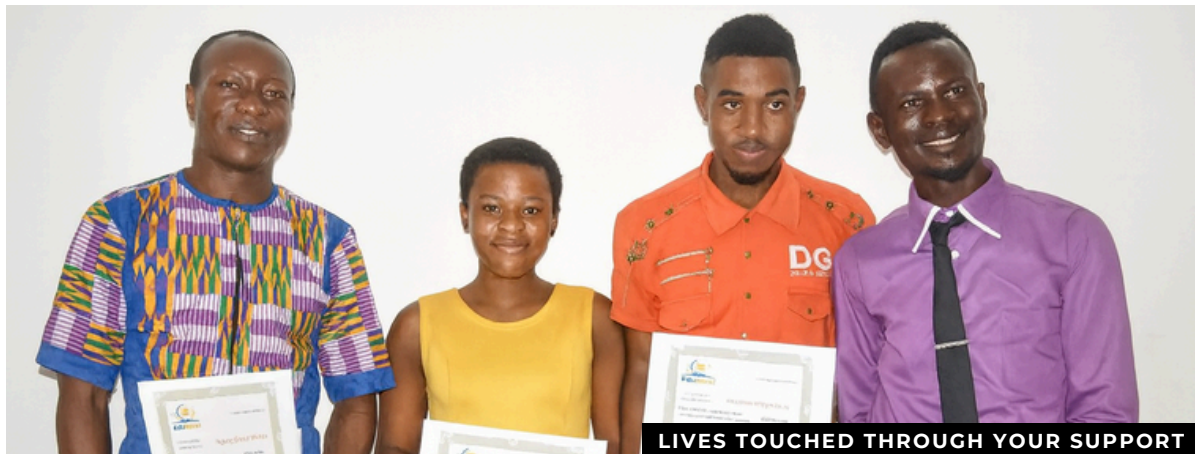
LIVES TOUCHED THROUGH YOUR SUPPORT